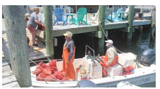
CGSP members on the CGSP boat assisting with the annual clam restocking of the Pond.

Be sure to check out the Shellfish/Aquaculture Series of our new publication, On the Pond. This new publication is sent to our members electronically each month and you can find it on our website, cgspblockisland.org.