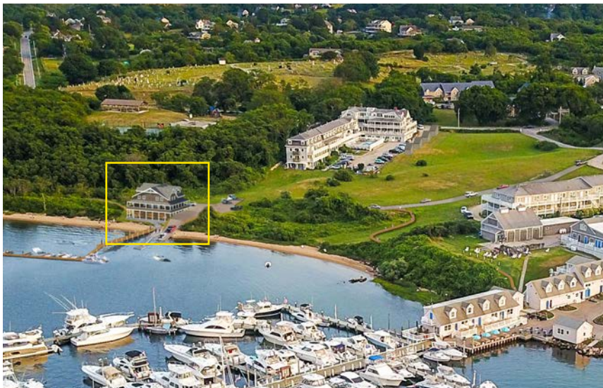
The yellow box in the photo above indicates the proposed facility.

Since we would like to gain access to both state and federal funding for this project, it was decided that after the completion of Phase 1, NCA would contact the Mayforth Group – a government relations, advocacy, and strategic planning firm headquartered in Providence, RI that is currently working with the Town – to gain information about what would be required, from an architectural perspective. With this information, NCA was able to give CGSP a proposal for Phase 2, and a contract was signed between CGSP and NCA on January 10, 2023. The Town, CGSP, and NCA worked together to complete Phase 2, which included taking the information gathered in Phase 1, creating pre-schematic plans and elevations of the new Harbors Facility and associated site development, including docks, vehicular and pedestrian access. A pre-schematic cost estimate was developed using current construction pricing, for the building based on the agreed upon square footages from the Phase 1 Study. A presentation site plan and 3D renderings of the facility were also developed for the Mayforth Group's use in applying for state and federal funding.