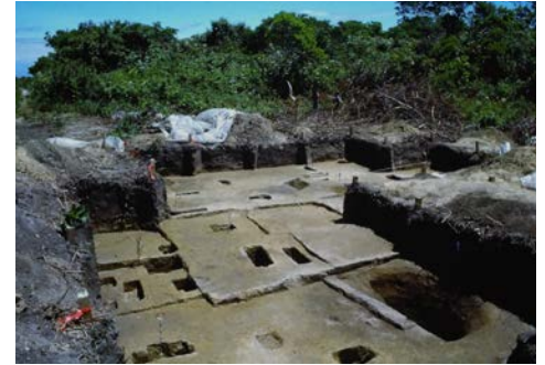
Excavated settlement site.