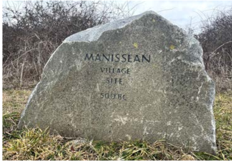
Stone marker noting the site of a Manissean village over two thousand years ago.