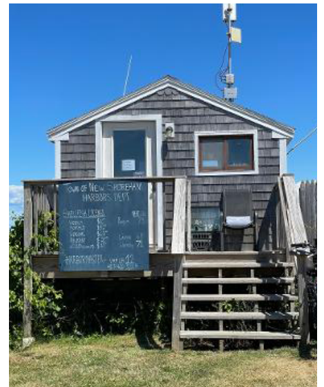
Harbormaster's Office at the Boat Basin.