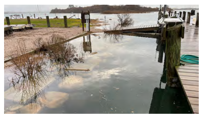
A very high tide at BIMI, January 2022.

The SLR Committee meets at Town Hall on the first Tuesday of each month at 3:00 pm and all are welcome to attend; public comments and input are encouraged.