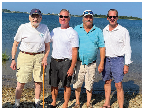
All names listed in photos from left to right.